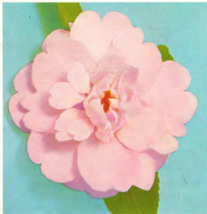
C. SASANQUA, JEAN MAY

SHOWA-NO-SAKAE —Semi-double to peony. Soft pink. Slow, low and compact. 12-18" $2.50; 18-24" $3.50; 24-30" $6.50; 30-36" $7.50