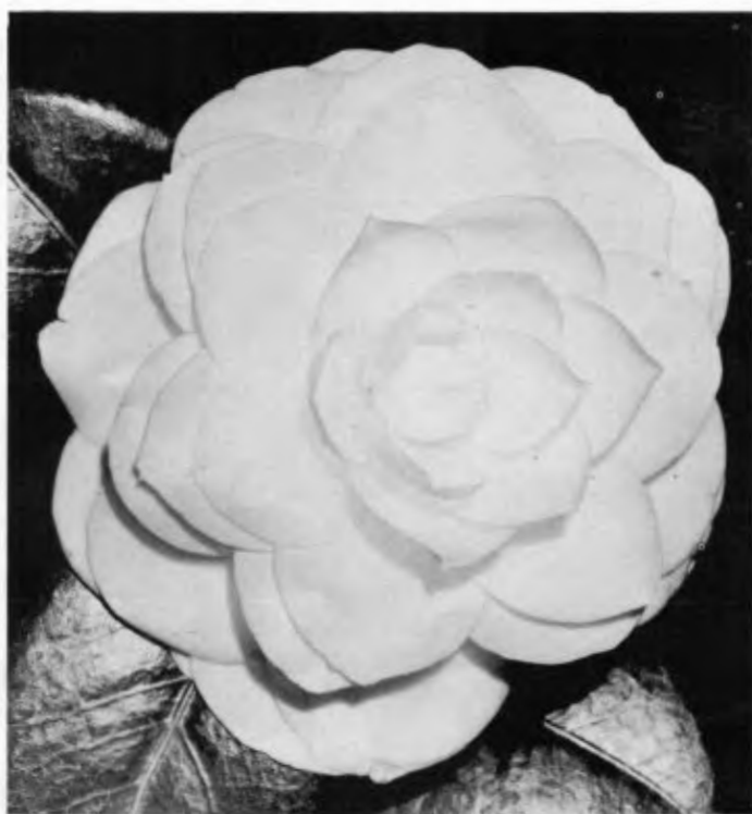
THOMAS D. PITTS

YVONNE TYSON —A new large, salmon pink, large anemone form. Medium, compact growth. M-L. 12-18" $6.00*; 18-24" $7.50*