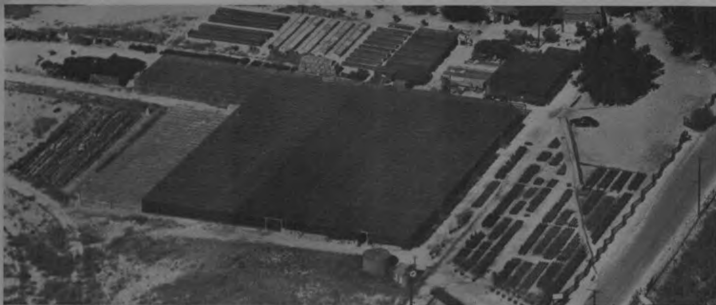
AERIAL VIEW OF NUCCIO'S NURSERIES