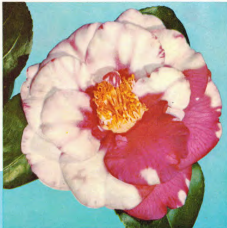
ADOLPHE AUDUSSON VAR.