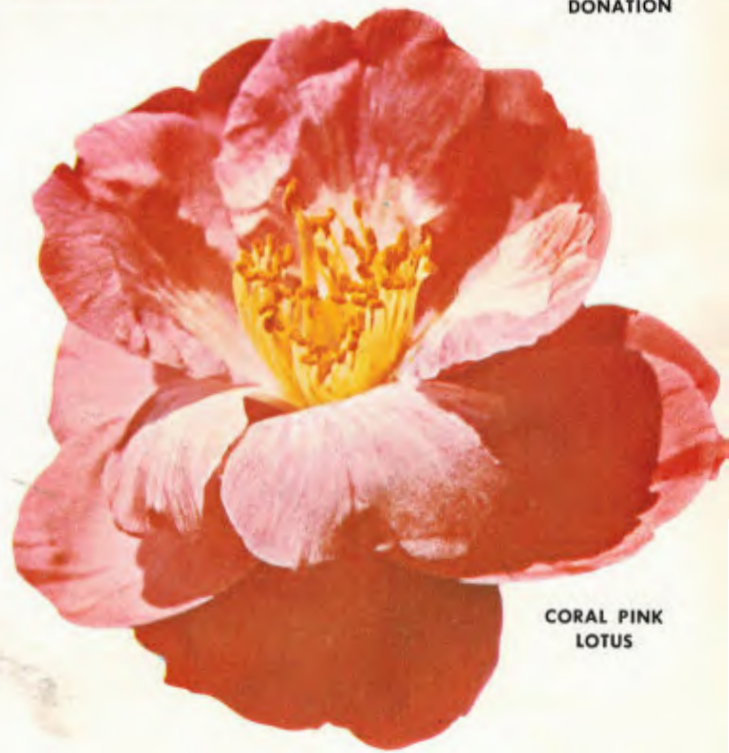
CORAL PINK LOTUS