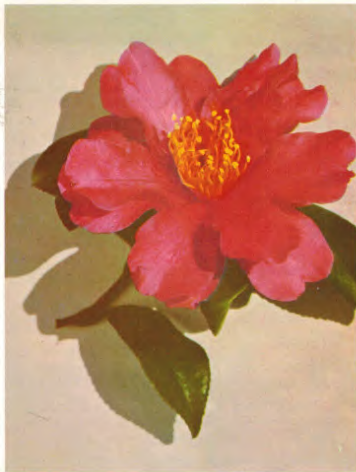
C. SASANQUA, HIRYU

YAE ARARE —Beautiful, large single white with petals tipped pink. Vigorous, bushy, upright growth. 12-18" $2.50; 18-24" $3.50; 24-30" $6.50; 30-36" $7.50